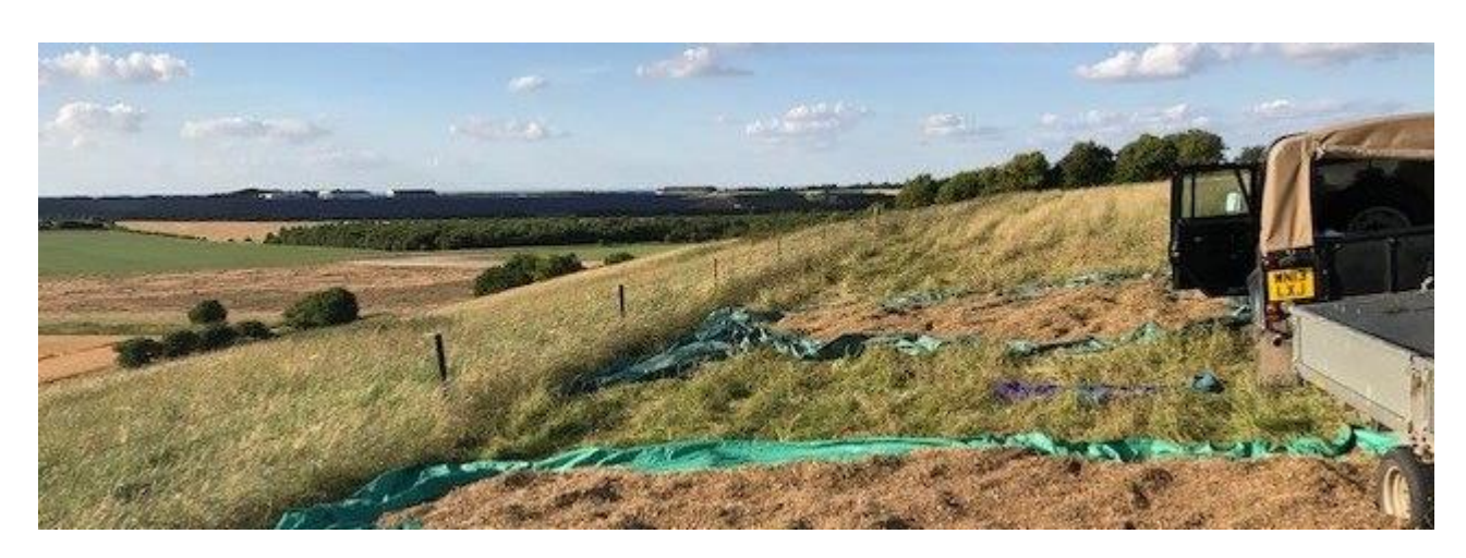
Drying seed harvested during grassland restoration workshop