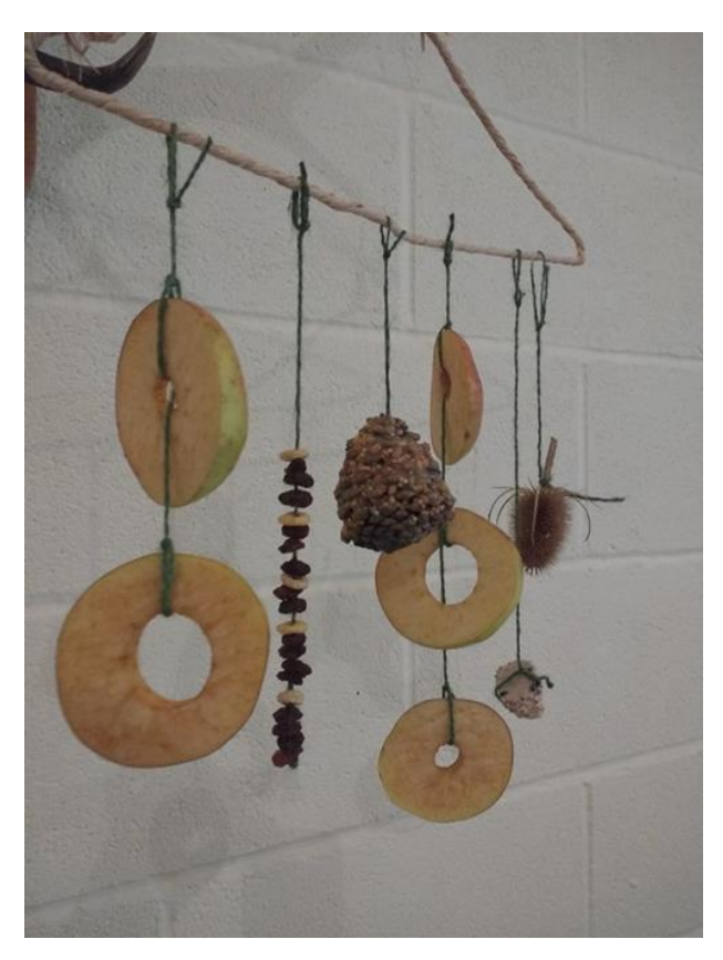
Natural bird feeders