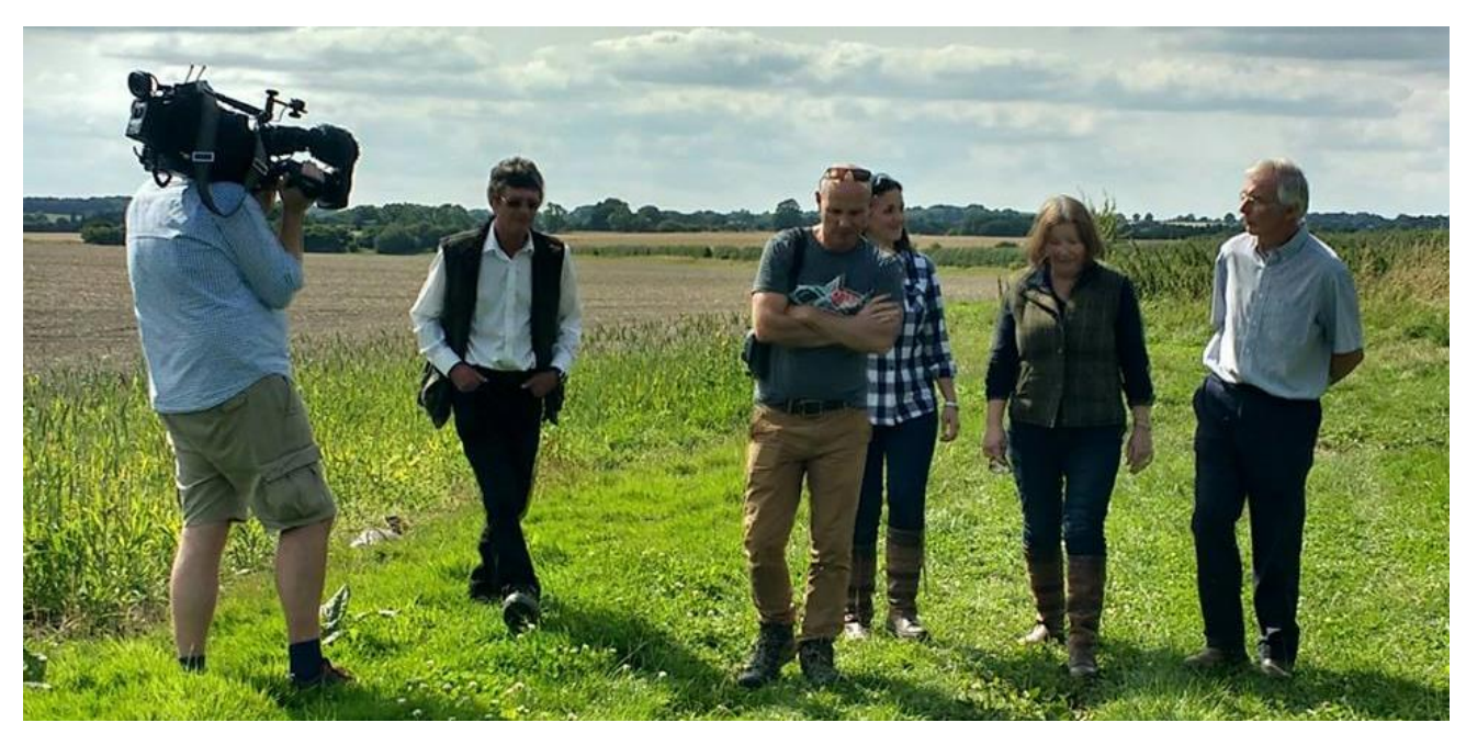
Filming for Points West