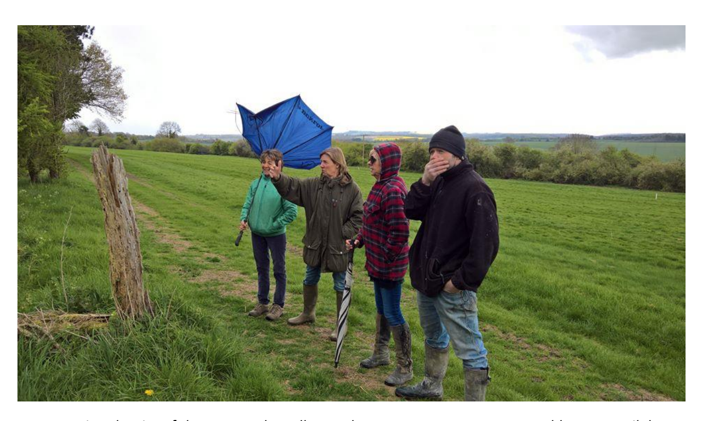
Inspecting the site of the proposed Marlborough Downs Nature Reserve on a blustery April day