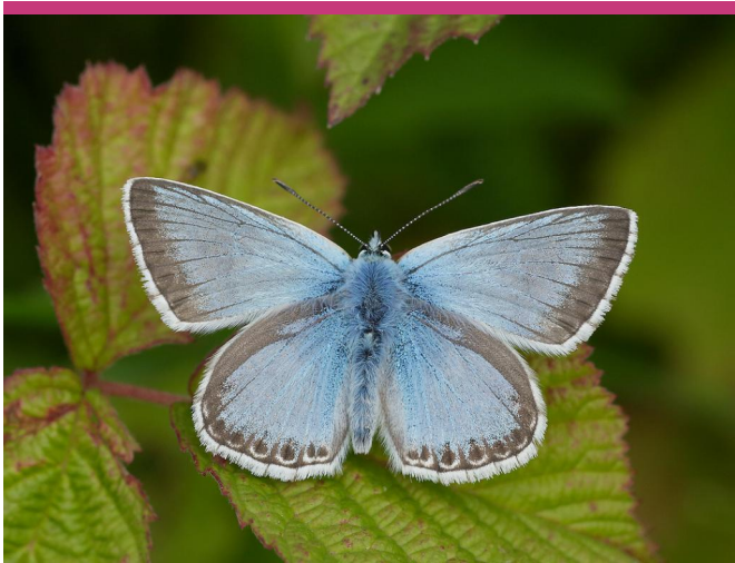
Chalk Hill Blue (male/upperwing)