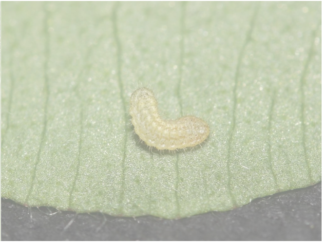
Chalk Hill Blue (young caterpillar).