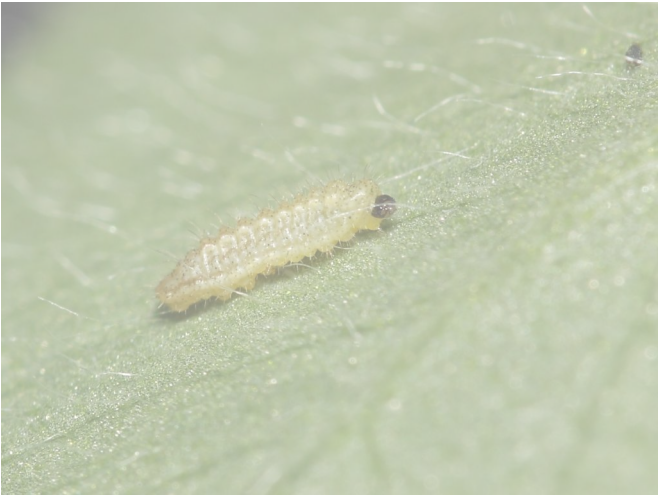
Chalk Hill Blue (young caterpillar).