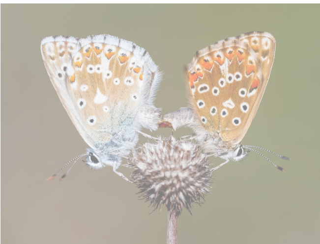
Chalk Hill Blue (male & female).