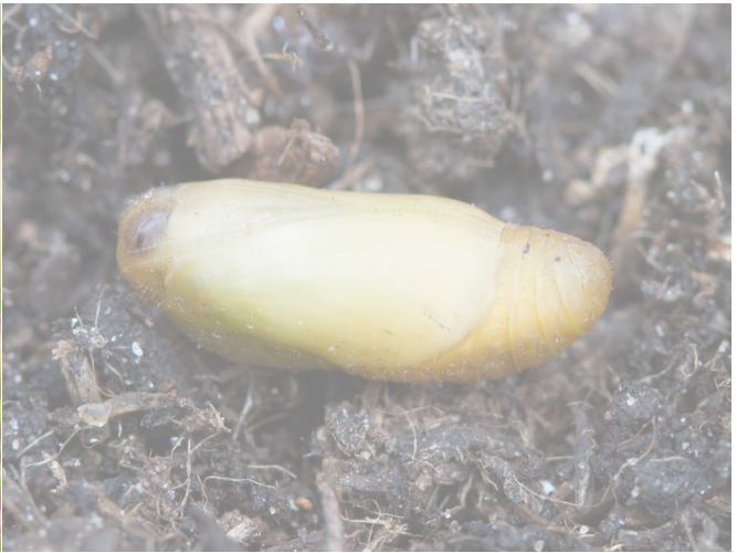
Chalk Hill Blue (pupa).