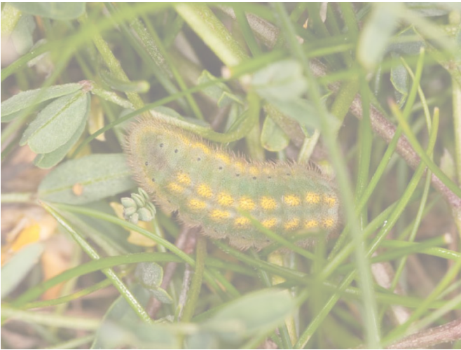
Chalk Hill Blue (caterpillar).