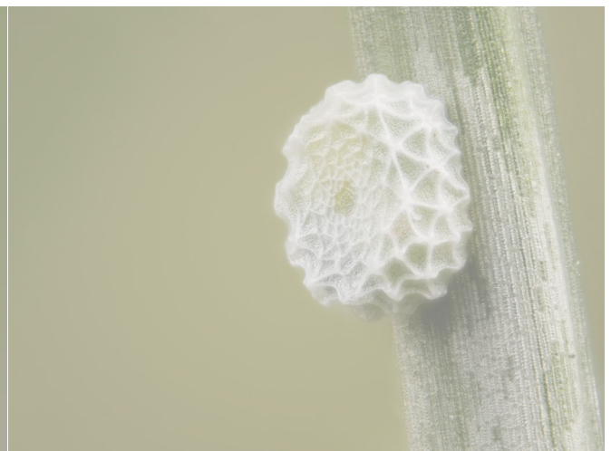
Chalk Hill Blue (egg).