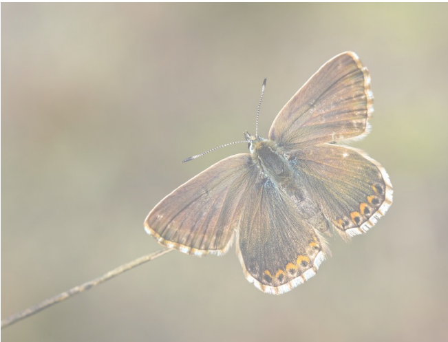
Chalk Hill Blue (female/upperwing).