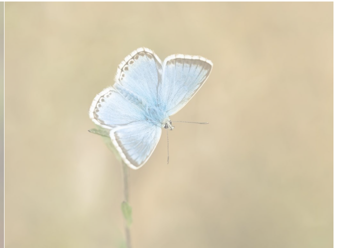
Chalk Hill Blue (male/upperwing).