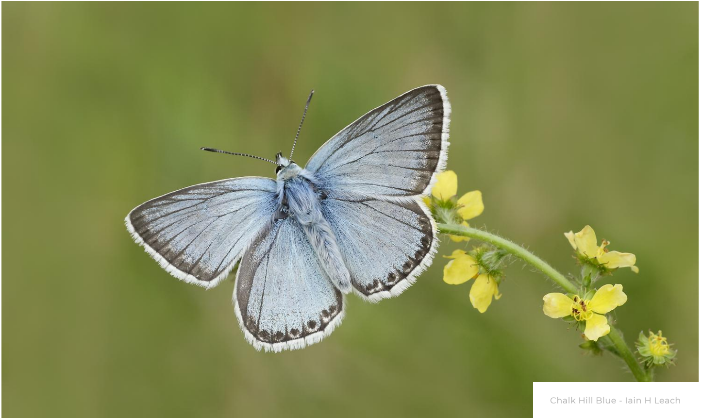
Chalk Hill Blue - Iain H Leach