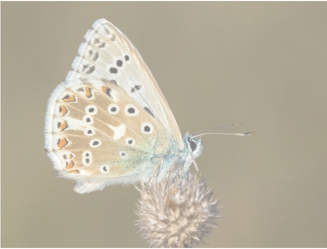
Chalk Hill Blue (male/underwing).