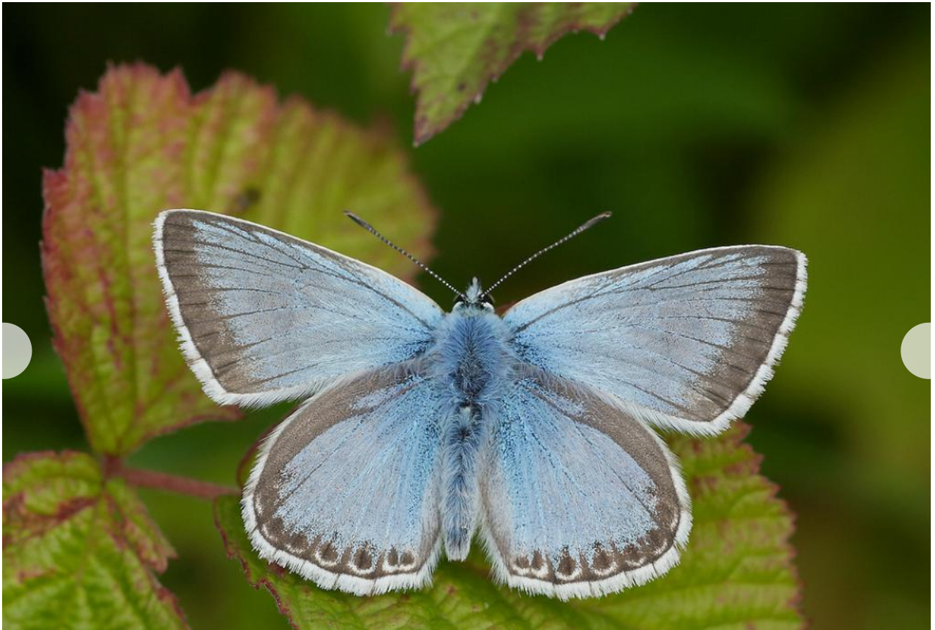
Chalk Hill Blue (male/upperwing) Iain Leach