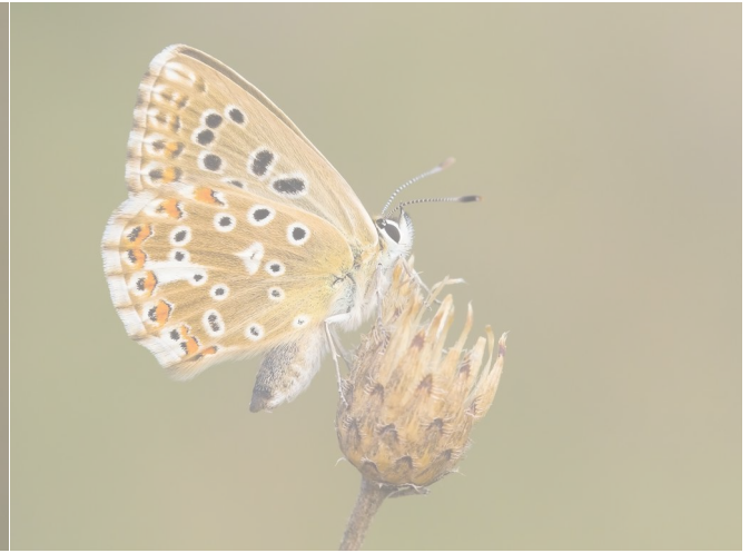
Chalk Hill Blue (female/underwing).