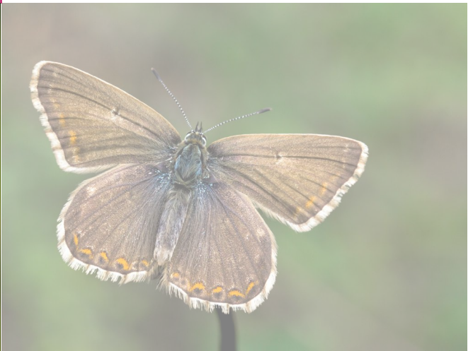
Chalk Hill Blue (female/upperwing).