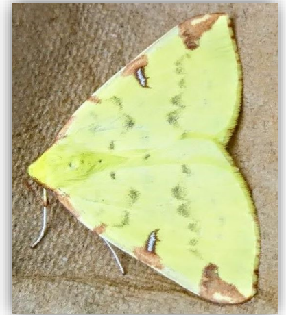
Brimstone moth (right) Foodplant:s: leaves of trees and shrubs