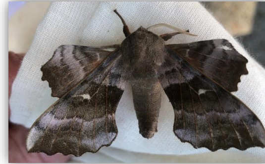
Poplar hawk-moth (left) Foodplant:s: leaves of poplars and willows