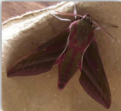
Elephant hawk-moth (above)

Foodplant:s: leaves of willowherbs, bedstraws and