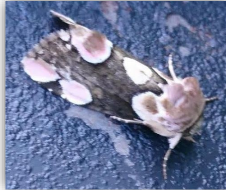
Peach blossom (right) Foodplant:s: bramble leaves

Foodplant:s: leaves of privet, lilac and other shrubs