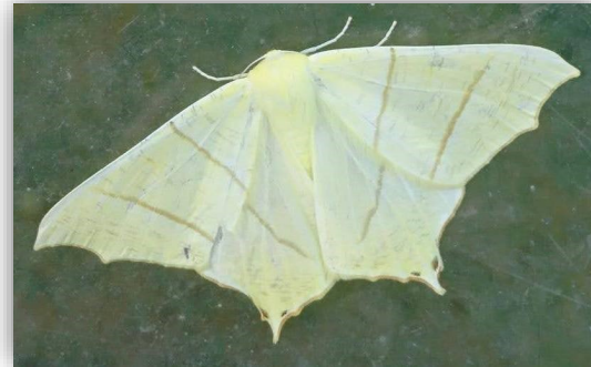
Swallow-tailed moth (below)

Foodplant:s: leaves of willow and poplars