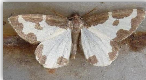
Clouded border (below)

Foodplant:s: leaves of poplars, willows and hazel