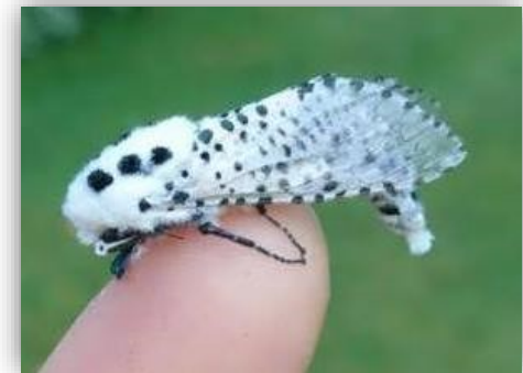
Leopard moth (above)

Foodplant:s: leaves of apple trees, sometimes poplars