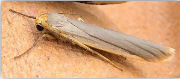
Common footman (above)

Foodplant:s: lichens, algae, leaves of thorn, clematis and bramble