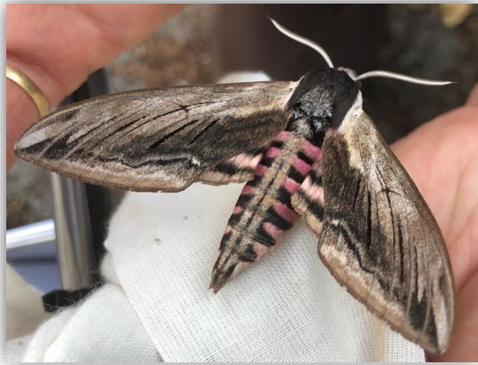
Privet hawk-moth (above)

Foodplant:s: leaves of privet, lilac and other shrubs