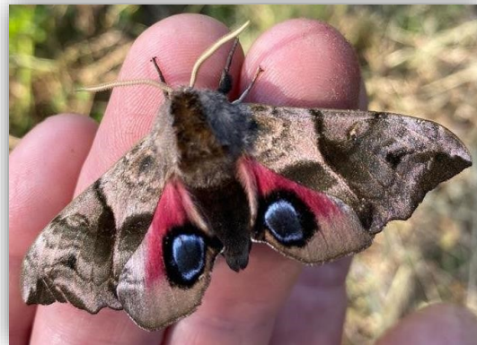
Eyed hawk-moth (above)

Foodplant:s: leaves of willowherbs, bedstraws and